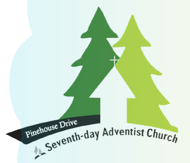
327 Pinehouse Dr Saskatoon, SK S7K 7Z4